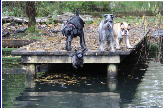
(last years winning picture of Frankie the Schnauzer and friends)

Get snapping over the summer or scroll through your log of recent pet pics and send your entries to: vets@bhbvets.co.nz